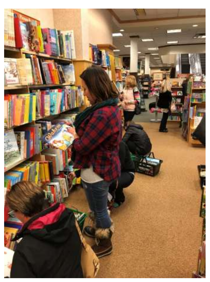
Teachers selecting books from Barnes & Noble for their classroom librarys