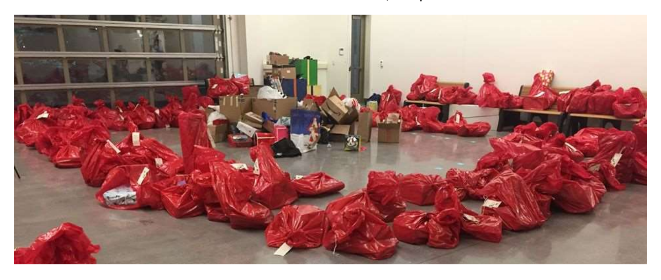
Gift Wrapping Party at GE's Customer Innovation Center for the GE Giving Tree Event