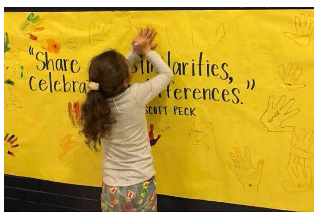
Multicultural Night – "Sharing our similarities, celebrating our differences."