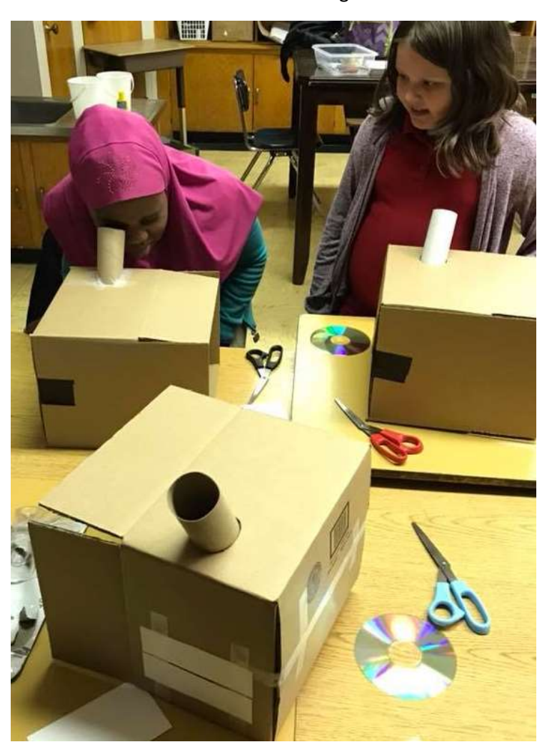
GE STEM Event - Light