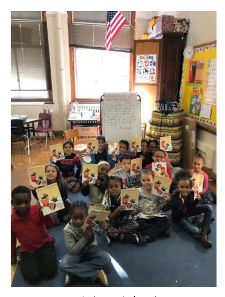
Hooked on Books for Kids